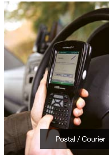
Postal / Courier